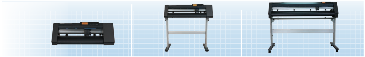
MODEL : CE7000-40